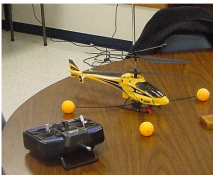
$189.00 Total Package.